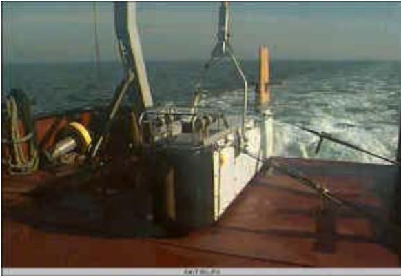
Georges Bank, North Atlantic

The improvements incorporated in the BIOMAPER II system enable the comprehensive broad-scale investigation of previously inaccessible features of the Georges Bank.